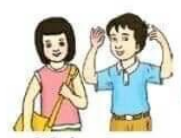
We have got short hair.