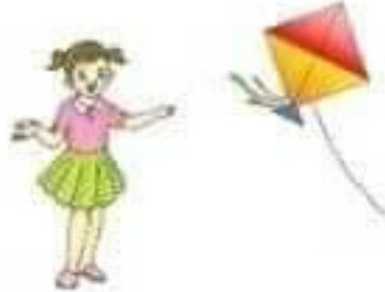
That is a kite.