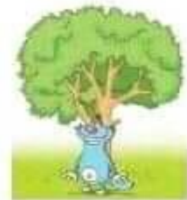
in front of

At, in, on, between, behind, under, near, next to and in front of are prepositions of place . We use them to tell where somebody or something is.