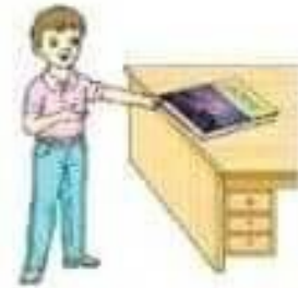
This is a book.