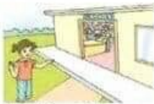
That is a library.