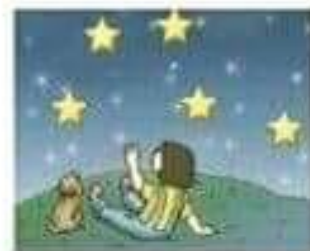
Those are stars.

We use this and these to point to the things that are near . We use this with singular nouns. We use these with plural nouns.