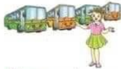
Those are buses.