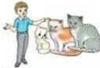
These are cats.