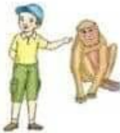
This is a monkey.